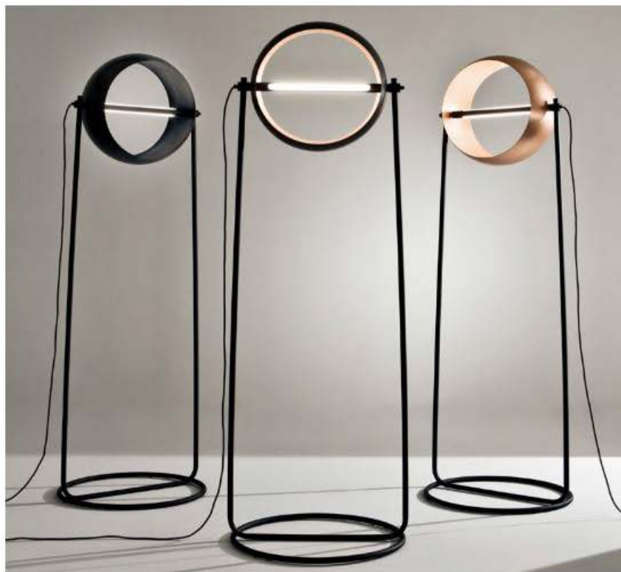
globe by edoardo colzani design studio A' design award winner in lighting products and projects design category.