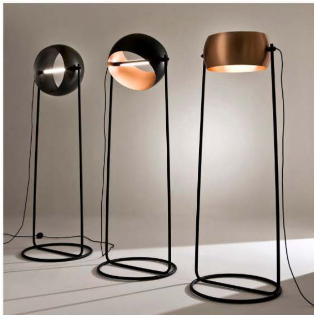
Globe Floor Lamp by Edoardo Colzani

A' Design Award & Competition is the Worlds' leading design accolade reaching design enthusiasts in over 180 countries in 40 languages; A' Design Award winning works are translated to all major languages in order to connect design lovers, press members and design buyers from across the globe. If you're interested, you can register your design, here .