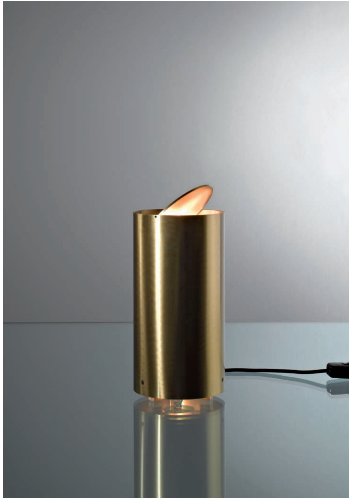
Table lamp with satin brass structure, adjustable upper disc, and halogen bulb. The disc allows to modify the light direction and to change its intensity according to any need.

The distinguishing elements of this lamp are the use of satin brass and the introduction of the adjustable disc: simple shapes meet high quality materials for an astonishing result.