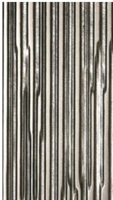
Liquid Metal Tin