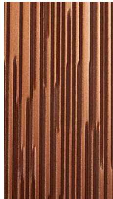
Liquid Metal Copper

_The finishes shown are indicative and refer to the entire production range. Laurameroni reserves the right to modify the range without warning.