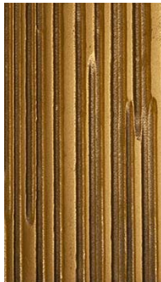
Liquid Metal Gold 9k