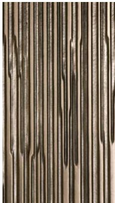
Liquid Metal Bronze