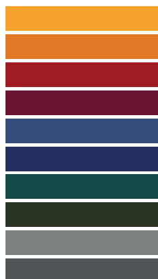
Available in all RAL / NCS colours

The finishes shown are indicative and refer to the entire production range. Laurameroni reserves the right to modify the range without warning.