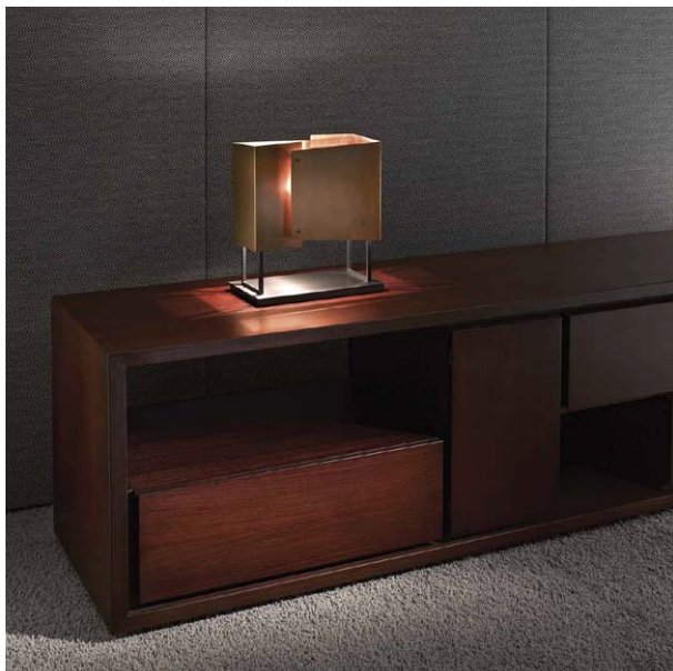
Table lamp with black nickered brass structure and shades elements in burnished brass. Nr. 2 Halogen bulbs 60W.

“Elements” Collection design Mark Anderson